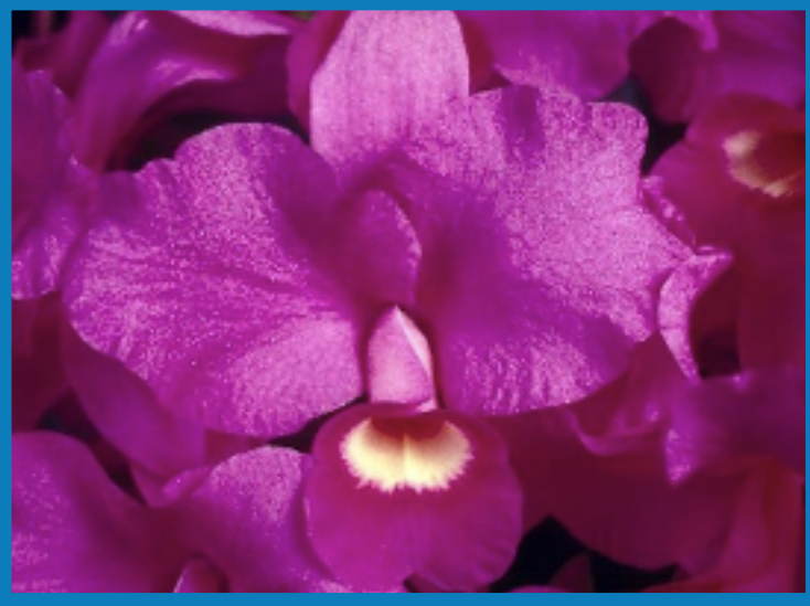
C. skinneri 'Angela' FCC/AOS