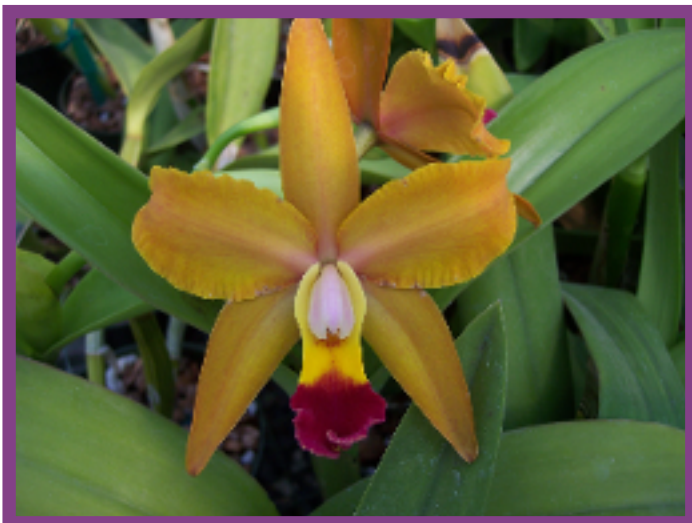
Rlc. Egyptian Queen 'Ínner Fire'