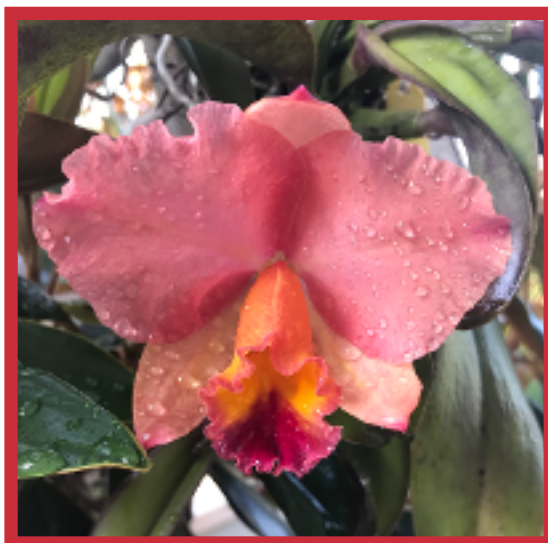
Slc. Final Touch 'Mendenhall' AM/AOS