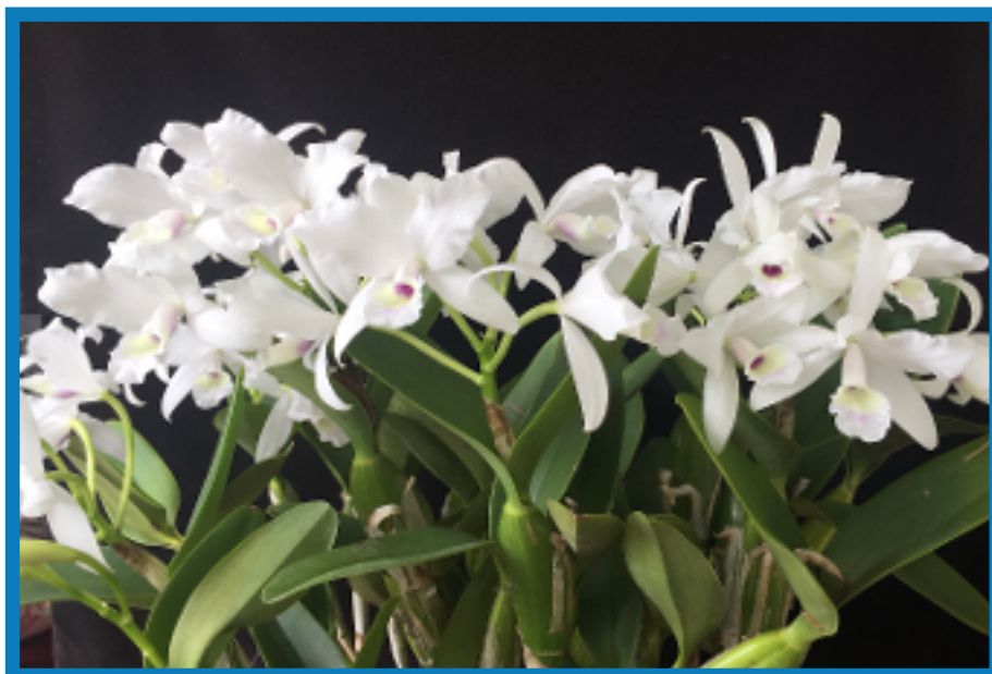
C. skinneri f. occulata