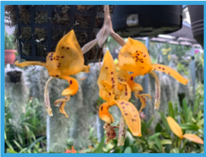
Stanhopea jenischiana 'Rsk' x self