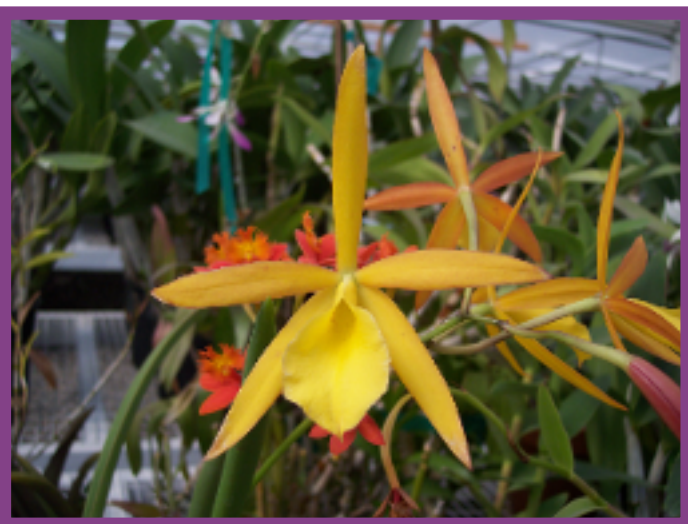
Bsn. Sunny Delight X Bl. Richard Muller