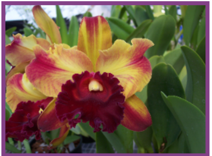
Rlc. Toshie Aoki 'Starburst' AM/AOS