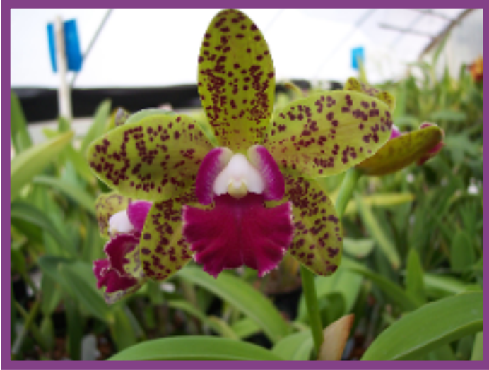
Blc. Sun Spots X Blc. Katherine Clarkson