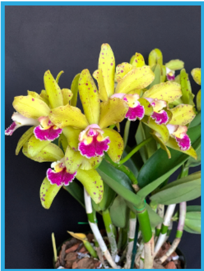
Blc. San Diego Hot Spots 'Frosty'