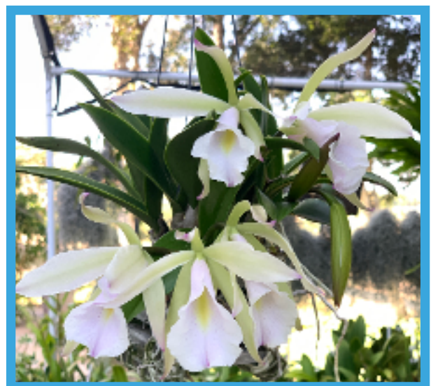
B. nodosa x Enc. Panache Morning 'Noelani'