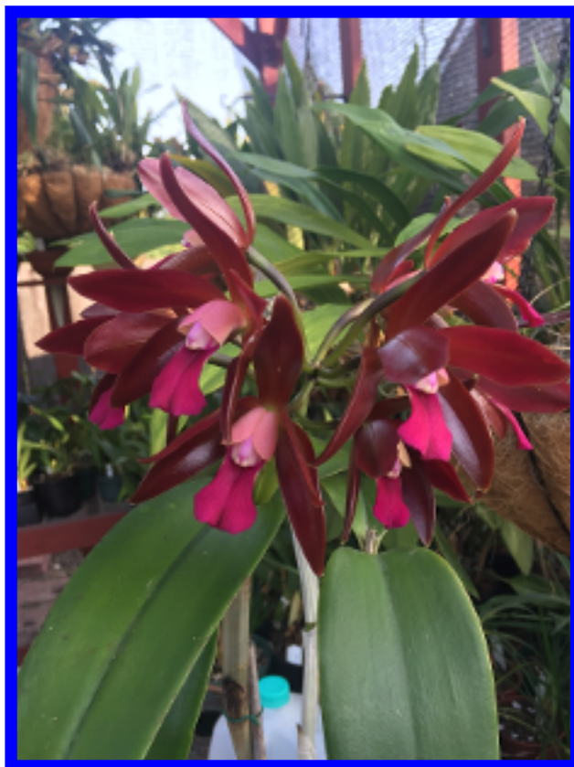
Lc. Panache Amphora