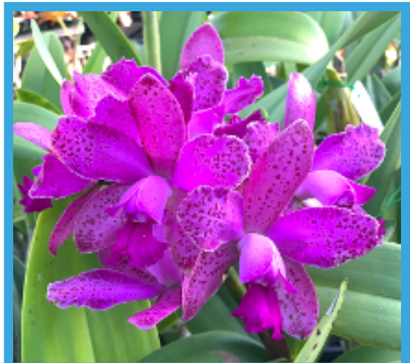
SV0910 Lc. Dean's Flair