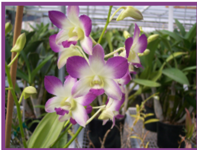
D. Aridang Blue 'Ángel'