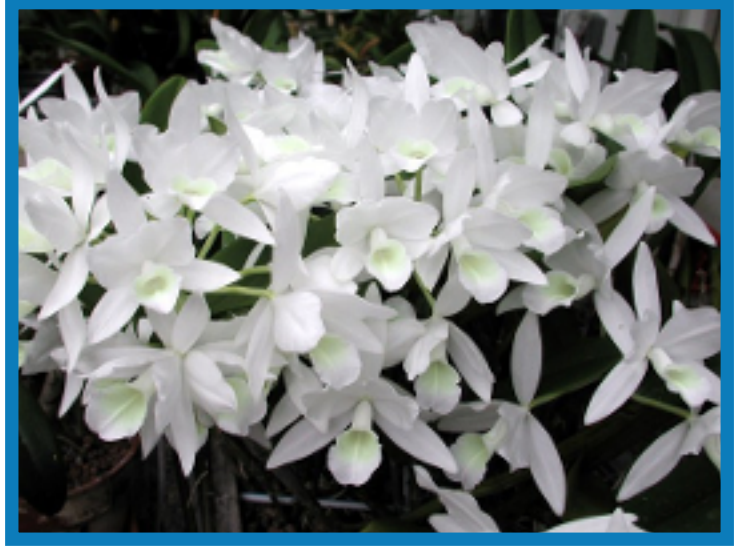
C. skinneri f. alba