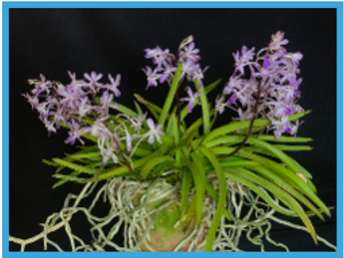
Neostylus Lou Sneary