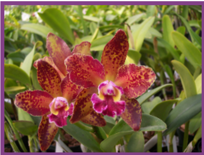
Rlc. Waianae Leopard