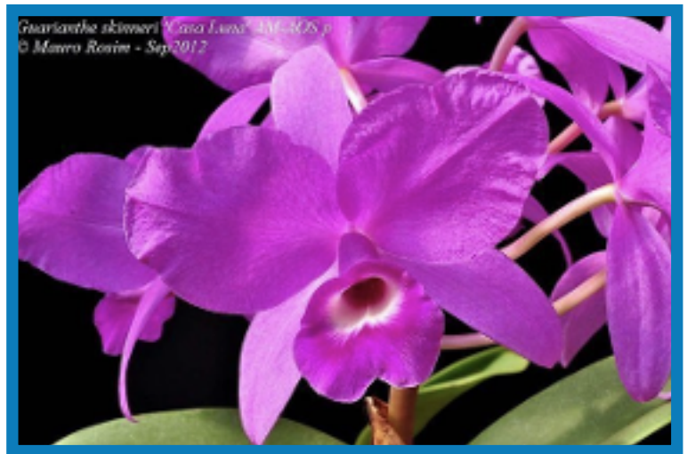
C. skinneri 'Casa Luna' AM/AOS