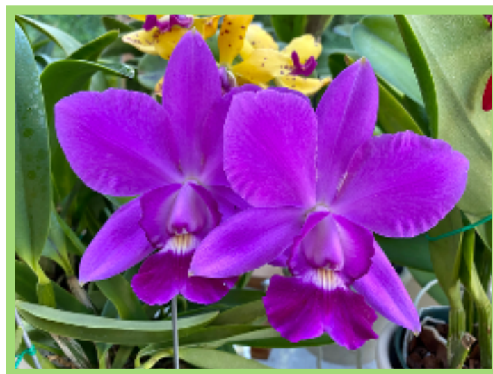
Lc. Aloha Case