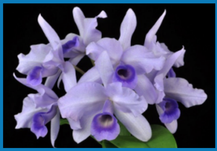
C. skinneri f. coerulea 'Orchid Eros'