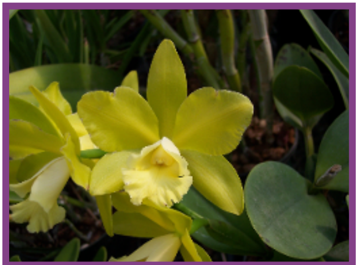
Blc. Hawaiian Passion 'Çarmela'