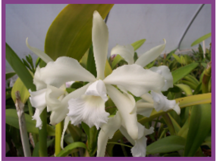
C. Elegans 'Álba'