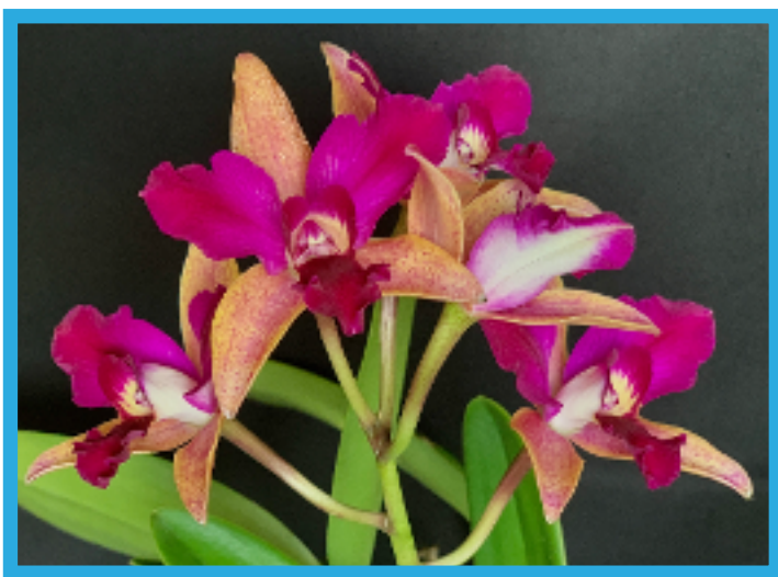
Slc. San Diego Star Burst 'A''